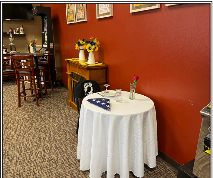
Memorial for the Unknown Soldier