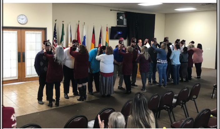
Fezzing of the new Nobles at the Fall Ceremonial