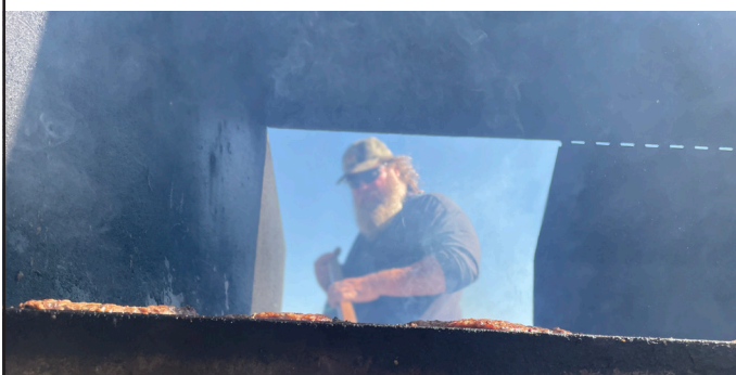
Who is that behind the grill at the Sportsman's Raffle!