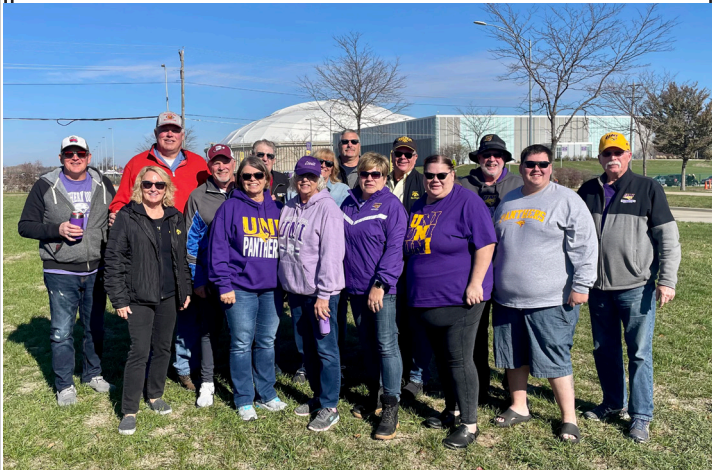
El Kahir's Shrine Bowl Club tailgating prior to the UNI/Western Illinois football game.