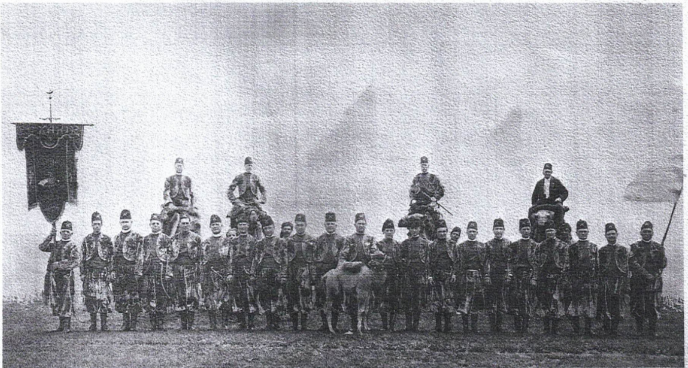
Approx 1916 to 1918