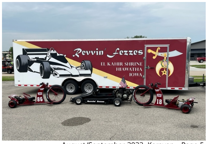
August/September 2022 Karavan - Page 5

The Revvin Fezzes Unit has been busy, busy, busy. Our Omelet Breakfasts have been well attended. In July, we served approximately 270 people. We joined with the Director's Staff to cover the costs of the two bouncy houses that were used for the Kids' Day. We have updated our trailer, too. Finally, we have been parading and enjoying every minute of it! Check out the picture below to see the two, new Glider Trikes we just received. We have had a growth in our membership in the past year and have at least two more future Revvin Fezzes working their way through Blue Lodge and, hopefully by the end of the year, they will be full fledged members of our Unit.