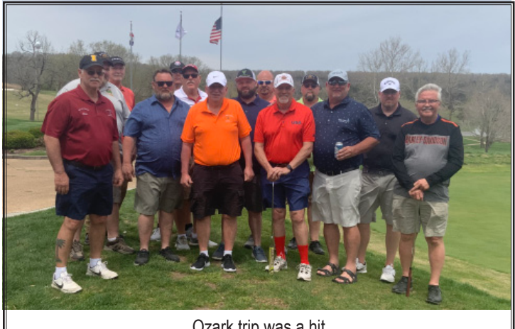
Ozark trip was a hit