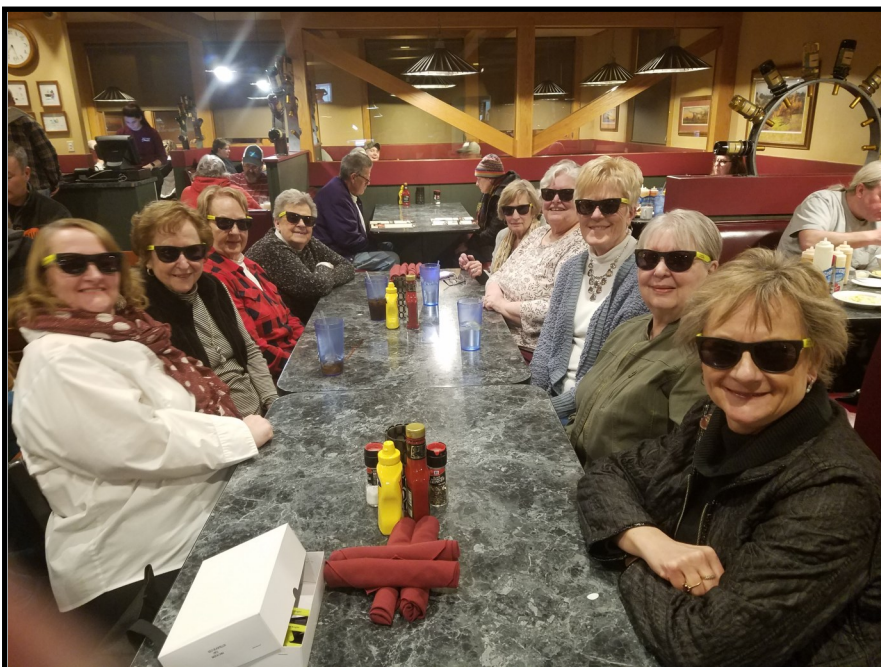
The Mobile Noblettes

If you went on the Potentate's ride, you know what this is, otherwise, just keep guessing.