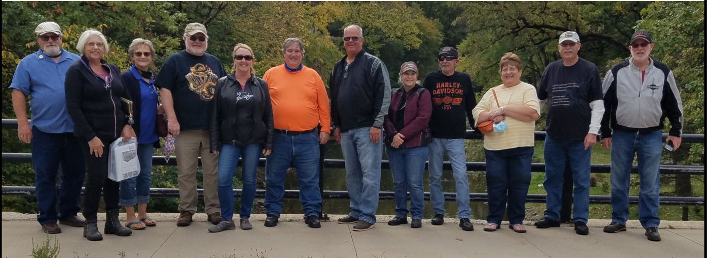
The intrepid riders