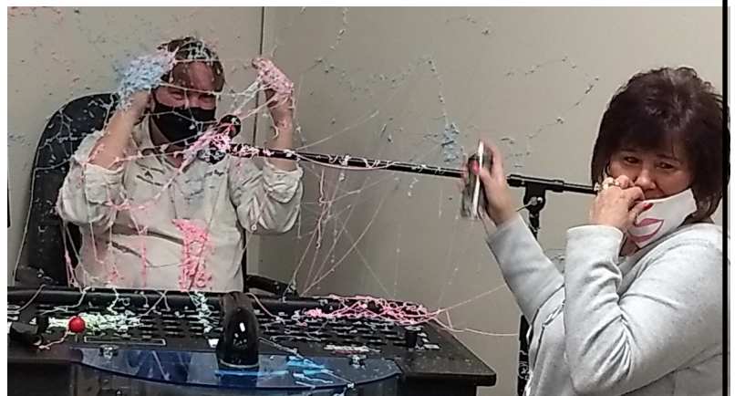
Is this how you call the numbers?