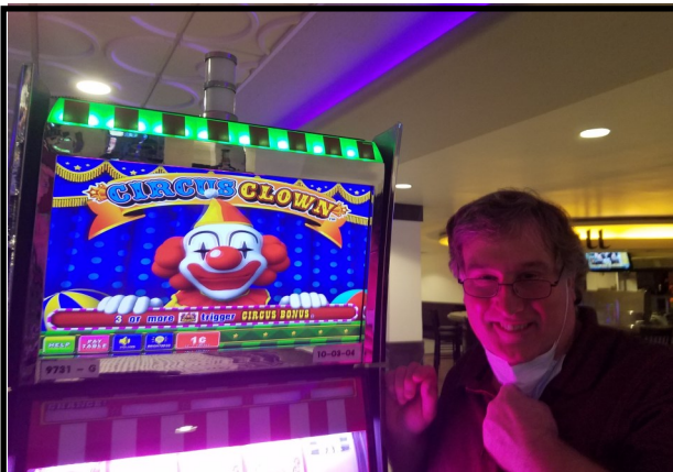
Winner, Winner — Chicken Dinner!