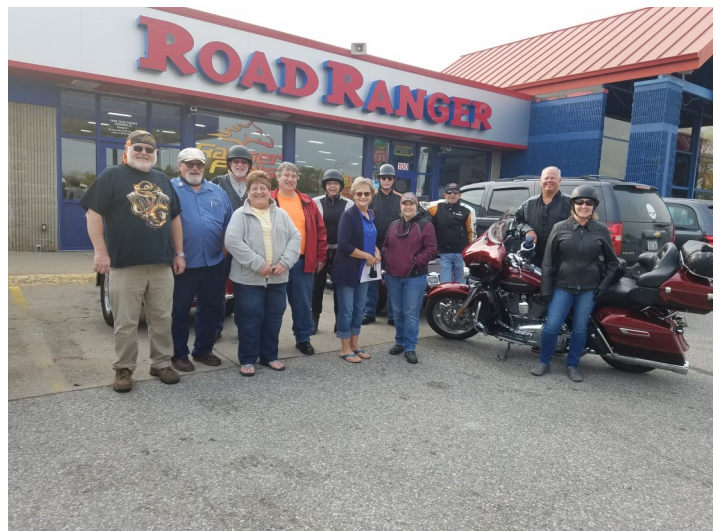
Time to leave Cedar Falls