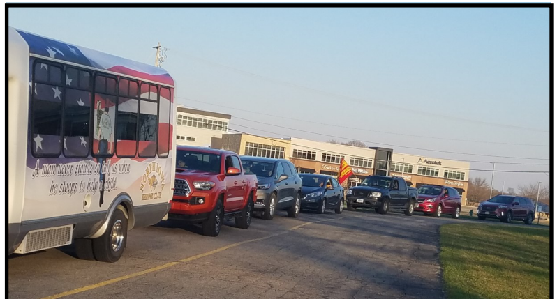
A Shrine Parade for a very ill Treasurer