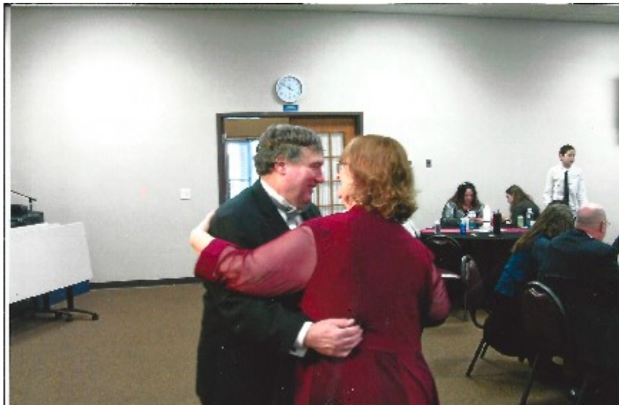
Potentate and First Lady Trying Social Distancing